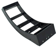
KX7 Empty Frame (RH)