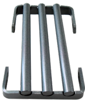
KX7 MaxRound Box Insert