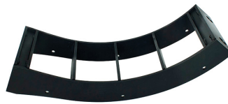
KX7 Empty Frame (LH)