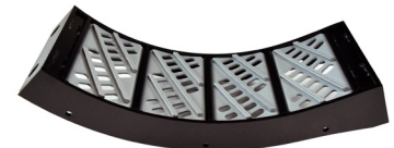
KX7 MaxThresh Concave Assembly (LH)