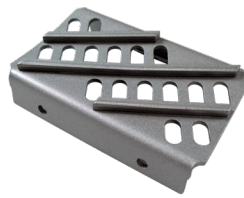
KX7 MaxThresh Box Insert

Contact Your Dealer to Order | Questions for Kondex? Contact Us: KX7@kondex.com or 800.447.1860