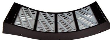
KX7 MaxThresh™ Concave Assembly (RH)