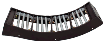
KX7 MaxRound Concave Assembly (LH)